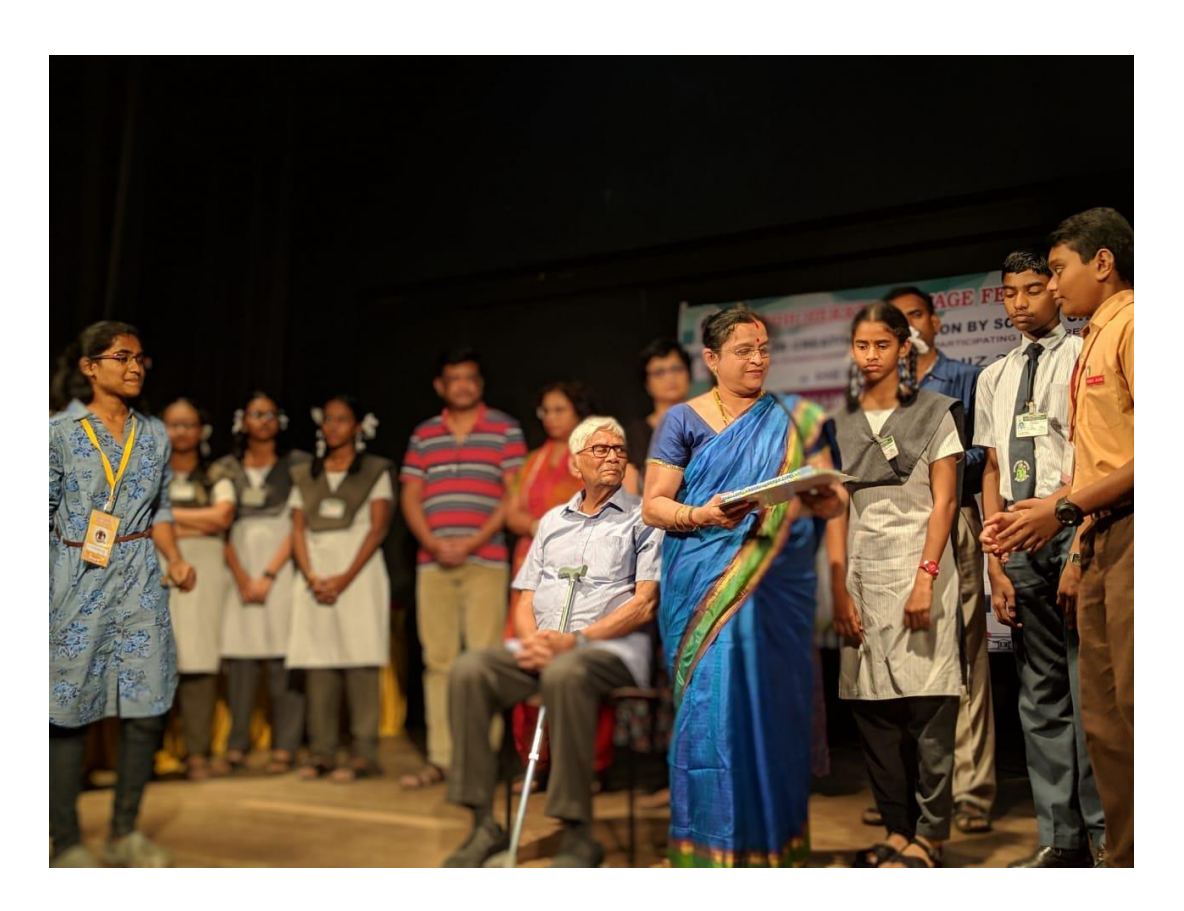
Prize distribution for the winners