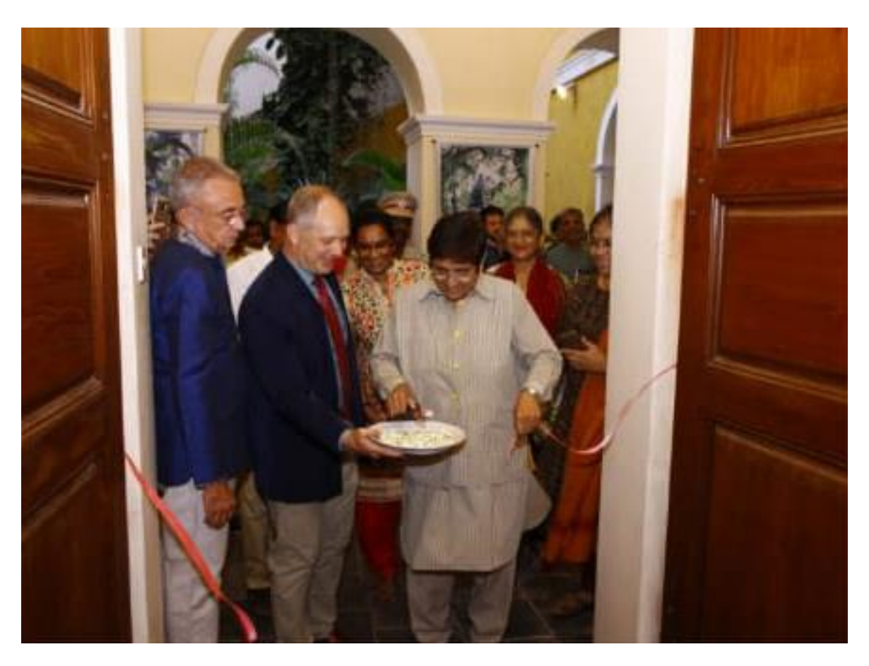
Lieutenant Governor Kiran Bedi inaugurating the event at EFEO

In sacred groves at the edges of settlements, Aiyanar, the local god, deploys his army of cows, horses, and elephants of terracotta. They stand in wait, ready for him to mount, so that he may chase away maleficent forces that threaten to disturb the serenity of sleeping villagers after dark. The exhibition featured the photographs of Jean-Louis Cardin's photographs titled Les bosquets sacres d' Aiyanar/ Groves of Aiyanar which was inaugurated by her excellency, Kiran Bedi, the Lieutenant Governor of Pondicherry. This photographic exhibition reflected the fragile and eerie beauty of such shrines, ancient and modern, that are spread across the length and breadth of the Tamil-speaking south. The exhibition was held at Ecole Française d'Extrême-Orient from 31<sup>st</sup> January to 28<sup>th</sup> February.