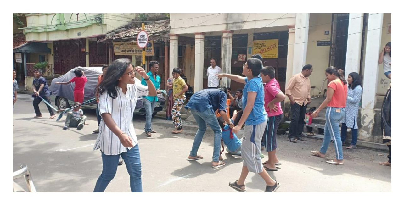
Children playing in groups