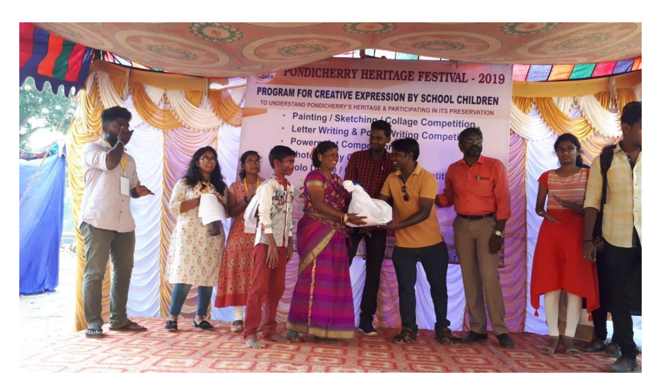
Prize distribution for the winners