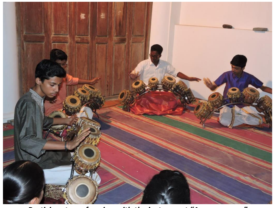
Participants performing with the instrument "Arumuganam"