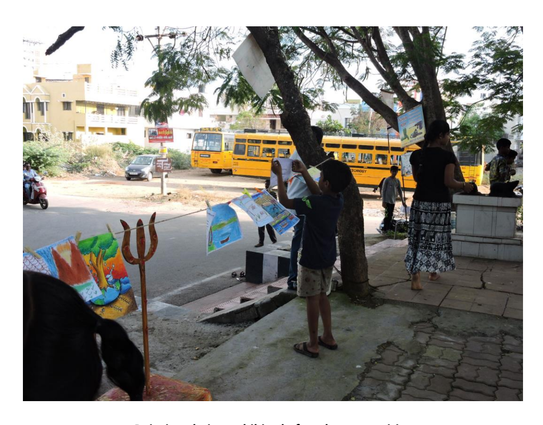
Paintings being exhibited after the competition

To create awareness among children to conserve the waterbodies of the town, a painting and Kolam (Rangoli) competition was organised by the French Institute of Pondicherry (IFP), INTACH Pondy and Pondy Can on the banks of the Kanaganeri lake on February 10<sup>th</sup>. The objective was to create widespread awareness among students and sensitise them towards protection of water resources, its augmentation, conservation and reuse. As many as 47 children from schools located near the lake participated in the event as a part of the Pondicherry Heritage Festival. The Kanagaeri lake needs a long-term action plan to conserve for the future generations. Frederic Landy, Director of the French Institute of Pondicherry, said that all lakes and tanks in South India were created for bringing surface water to the farmers. Now the farmers neither use ground water or surface water and there is no agriculture. The idea is to make people aware of the use of Kanagan Eri. Cities need green spaces and must preserve the natural habitat in order to attract tourists and investments. Hence Pondicherry Heritage Festival was used as an anchor to create awareness among the locals, especially children.