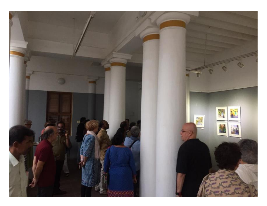
Visitors looking at the exhibited paintings