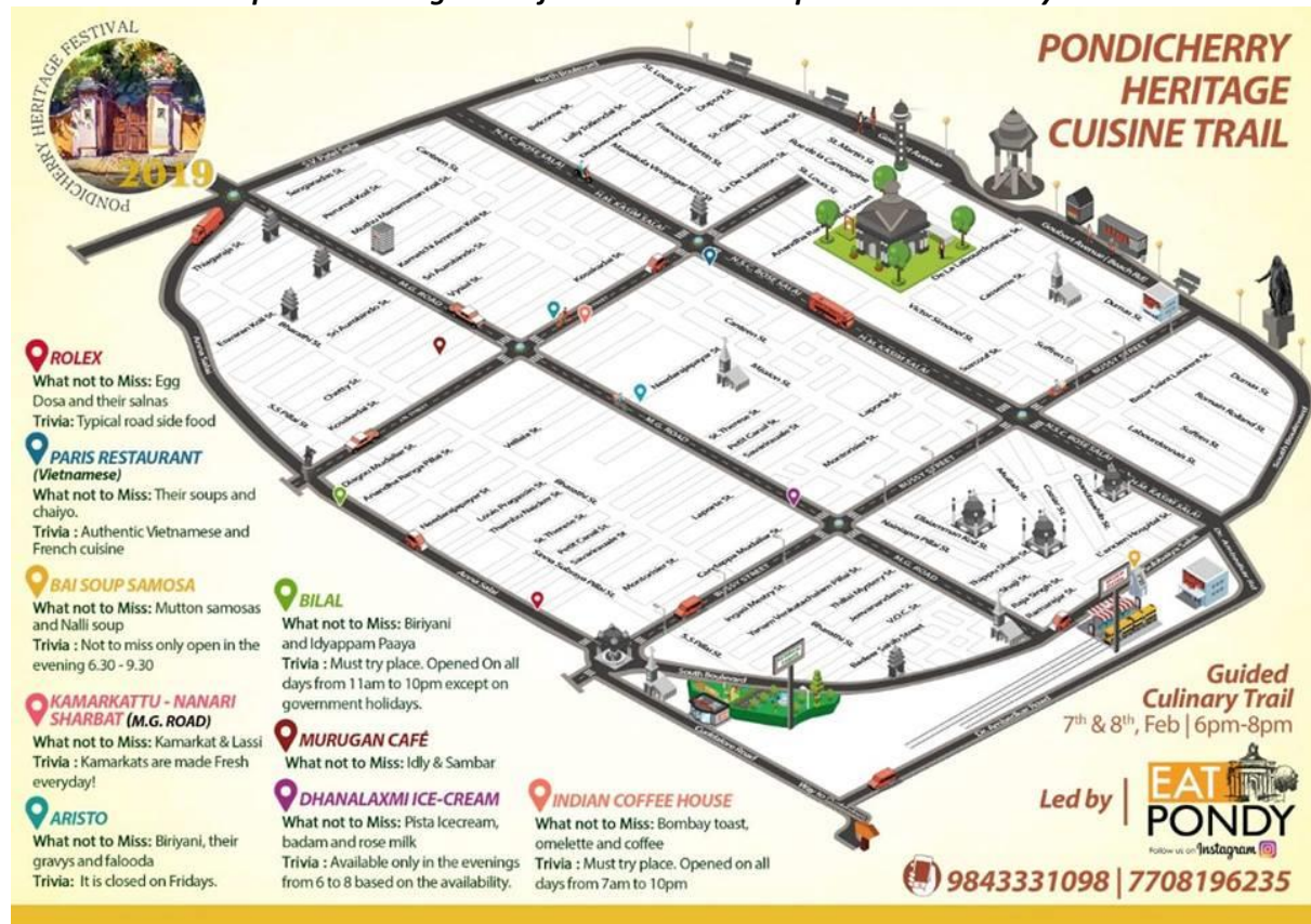
Heritage cuisine trail map