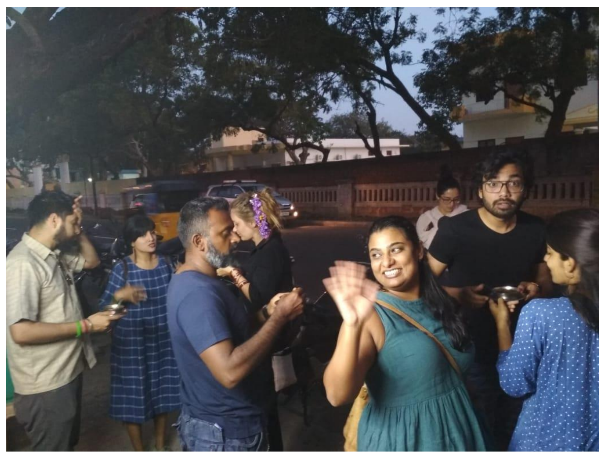
Participants relishing at the famous mutton soup stall near Railway station