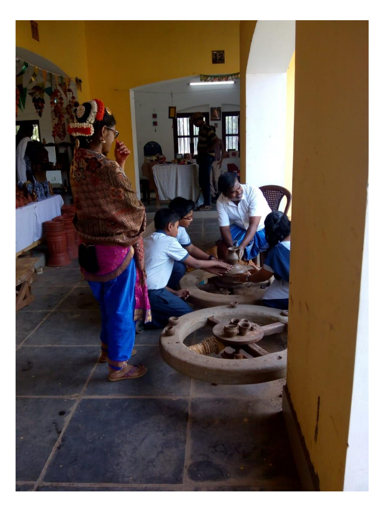
Students trying their hand in pottery wheel