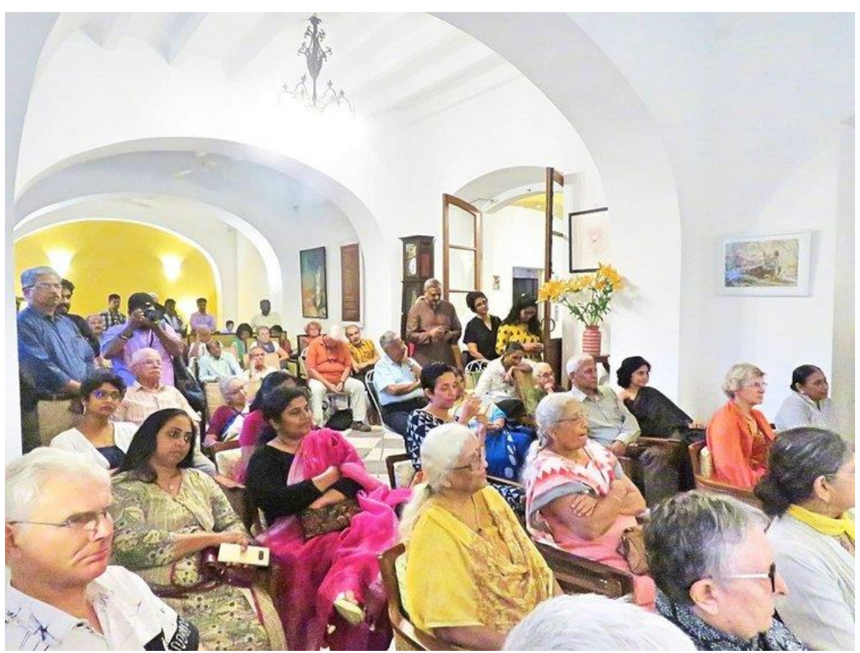
Gathering of locals at the book launch