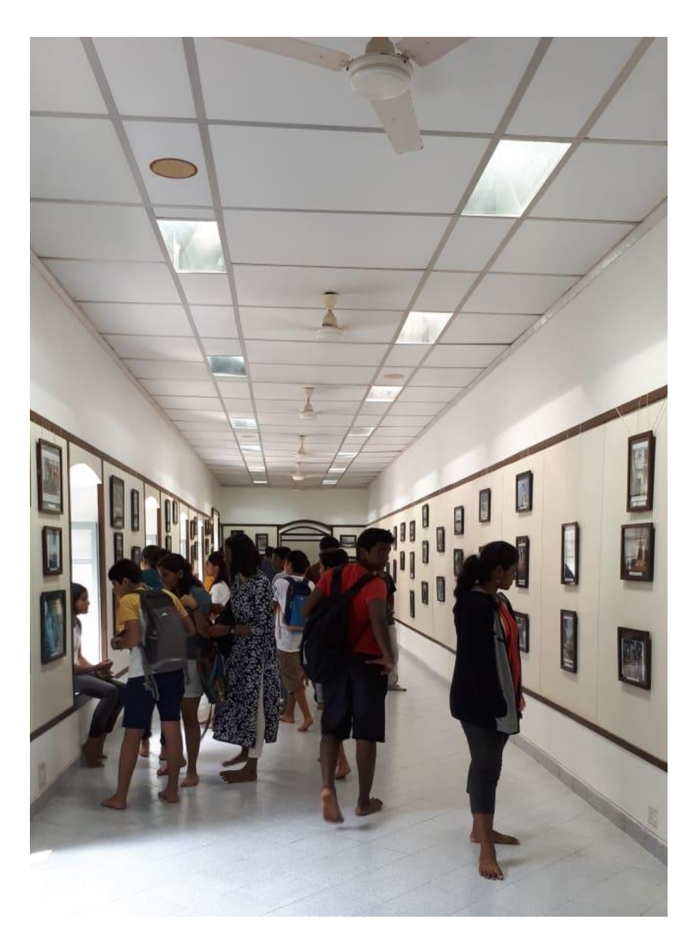
A young group of spectators at the Photography exhibition

Pondicherry heritage festival hosted a "Built Heritage and Streetscapes of Pondicherry" exhibition. The aim was to capture the heritage of Pondicherry through the lens of the locals and make them actively participate in conserving the heritage of Pondicherry. Many young and amateur residents enthusiastically participated in the competition. Art work created by school children on the art activities event were also displayed in the exhibition. The exhibition was held at the Ashram Exhibition Hall in the beach road for a period of 5 days from 28<sup>th</sup> January to 1<sup>st</sup> February. The event was hosted by Ms. Kakoli Banerji, Pondicherry heritage festival team and INTACH Pondicherry.