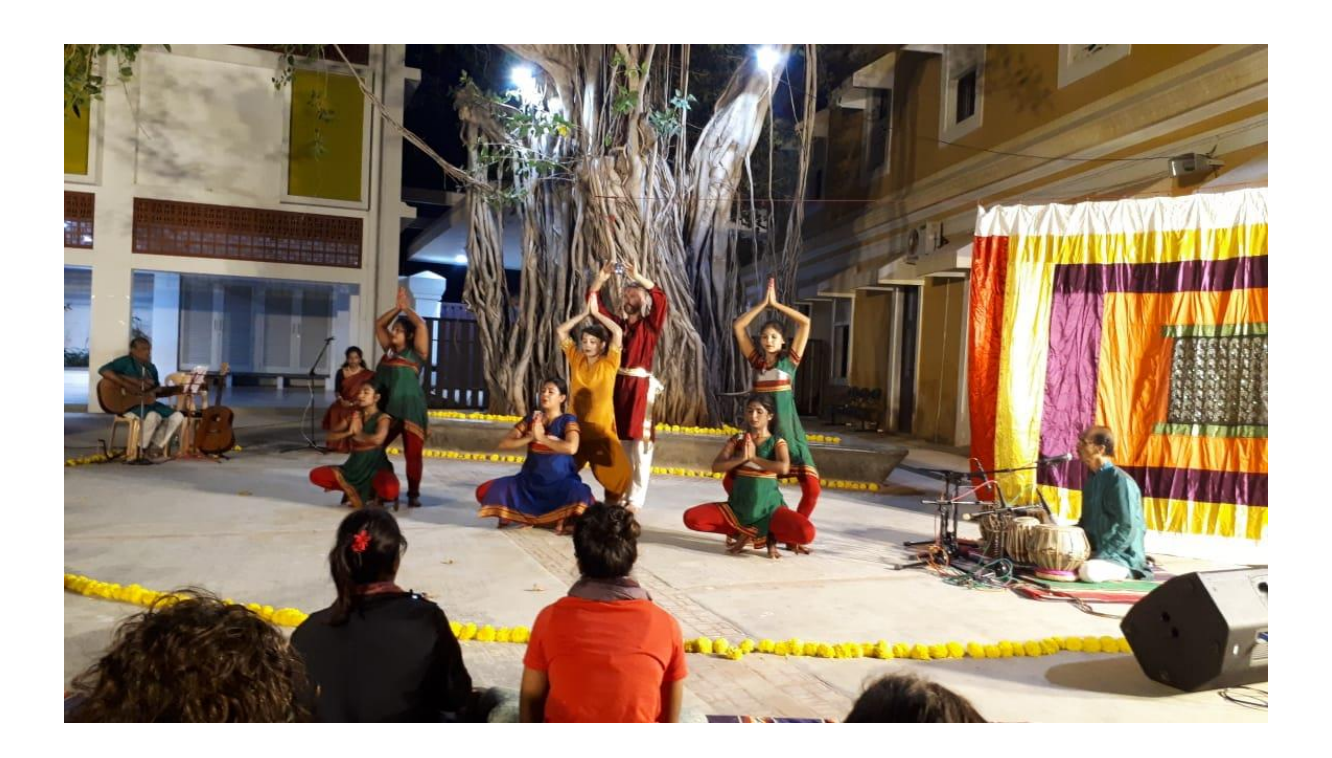
Artists performing at Lycee Français

Starting with a sloka in Sanskrit followed by songs and poems written by Annamacharya, Amir Khusroo, Namdev, Meera bai Rabindranath Tagore and Boloram Jana, in seven different languages from four corners of the country. Poojarini led the singing as she danced, with a guitar and tabla accompaniment. This unique and fluid performance with the lilting melodies in the multiple languages were further enhanced by the French circus artist who danced with a crystal ball.