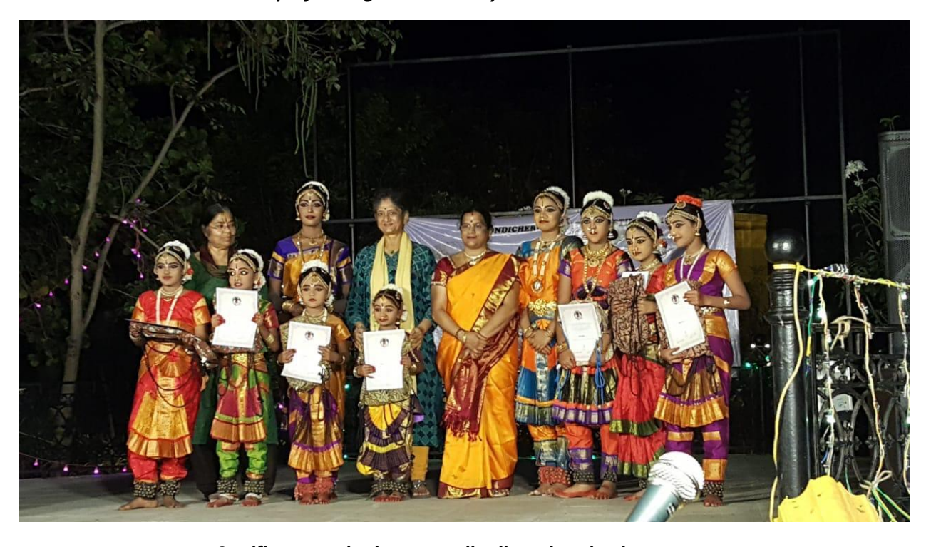
Certificates and prizes were distributed to the dancers