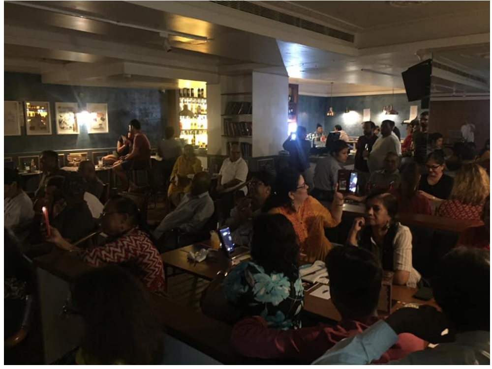
Gathering at the Story teller's bar