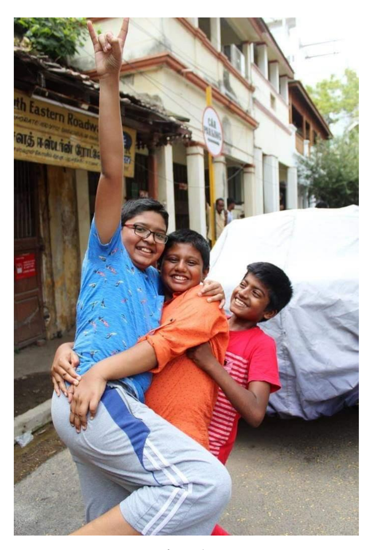
Happy faces in the event