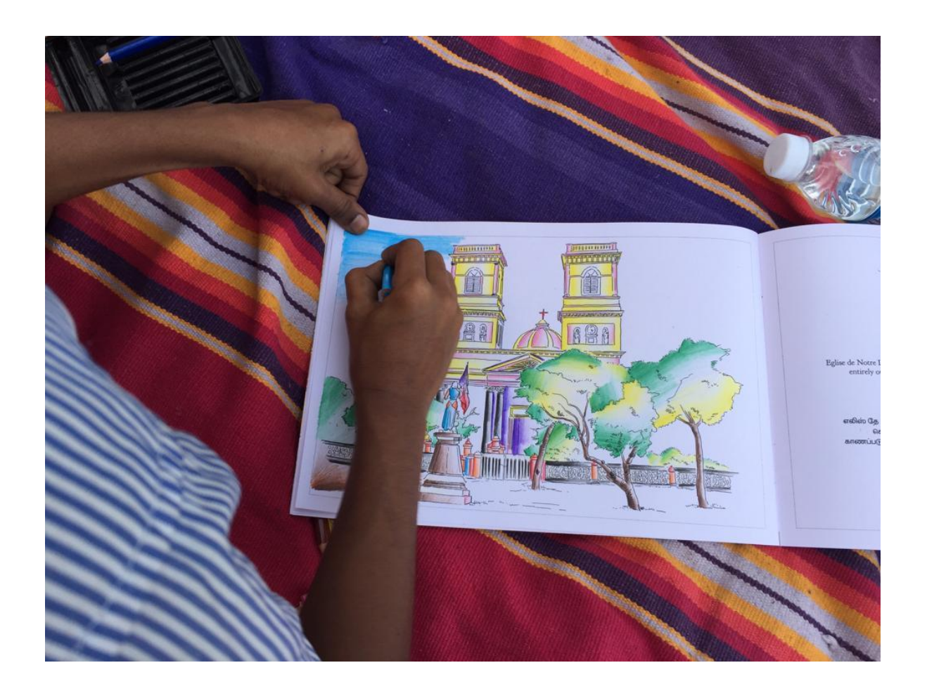
A participant colouring the Notre Dame church in the Colour Pondy's beauty book

On the 11th February 2019, evening, around 80 school children were invited to French Consulate lawn for the Heritage colouring event "Colour Pondy's Beauty" – for children and adults in love with Pondicherry 's Heritage". During the evening the French counsulate distributed the book to school children along with colouring pencil and required stationary. The kids were excited to colour the heritage of Pondicherry from the book. The Colour Pondy's heritage was the last event of Pondicherry Heritage Festival 2019.