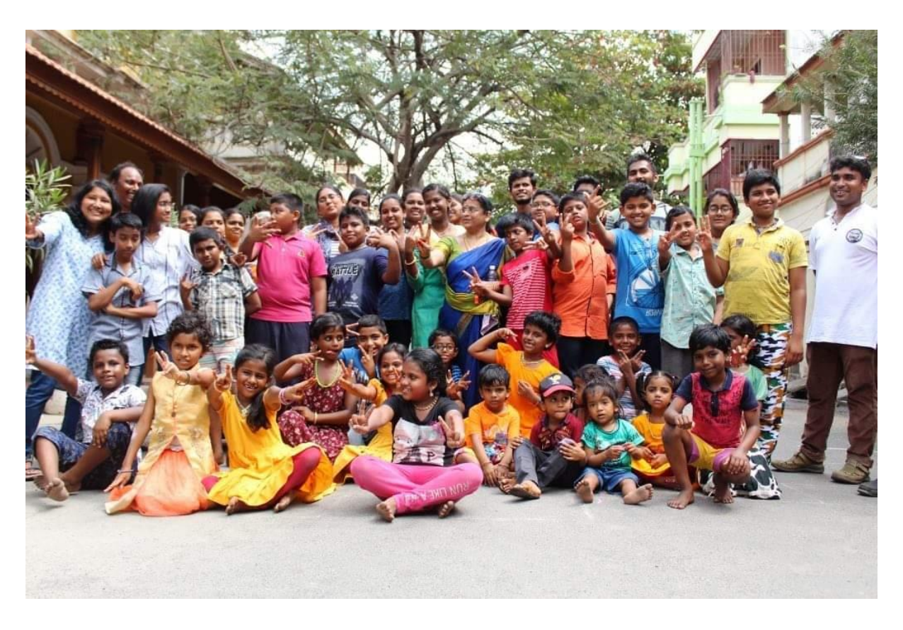
A group picture after the successful event