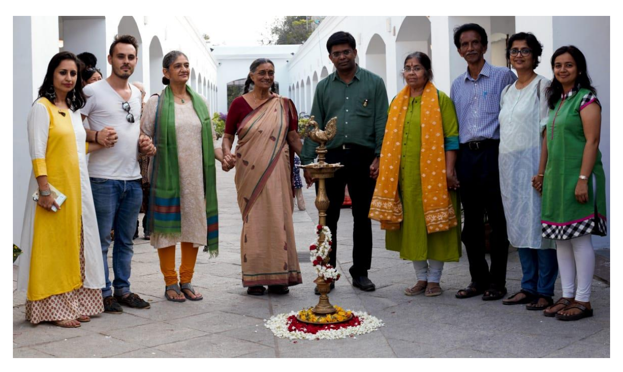
Made in Pondy team of the Pondicherry Heritage Festival

The heritage of creativity and entrepreneurship continues to this day. Each year at the Pondicherry heritage festival, made in Pondy brings a collection of the finest products in the region, made and design by our brightest local talent. The products were at sale in the Crafts bazaar, Gandhi Thidal from 1<sup>st</sup> February to 5<sup>th</sup> February.