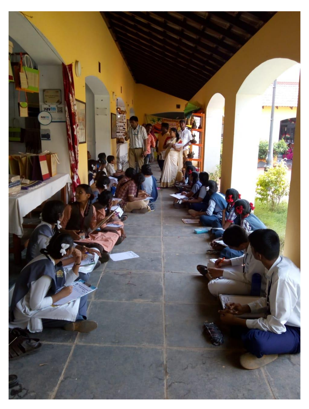
Writing competition in progress