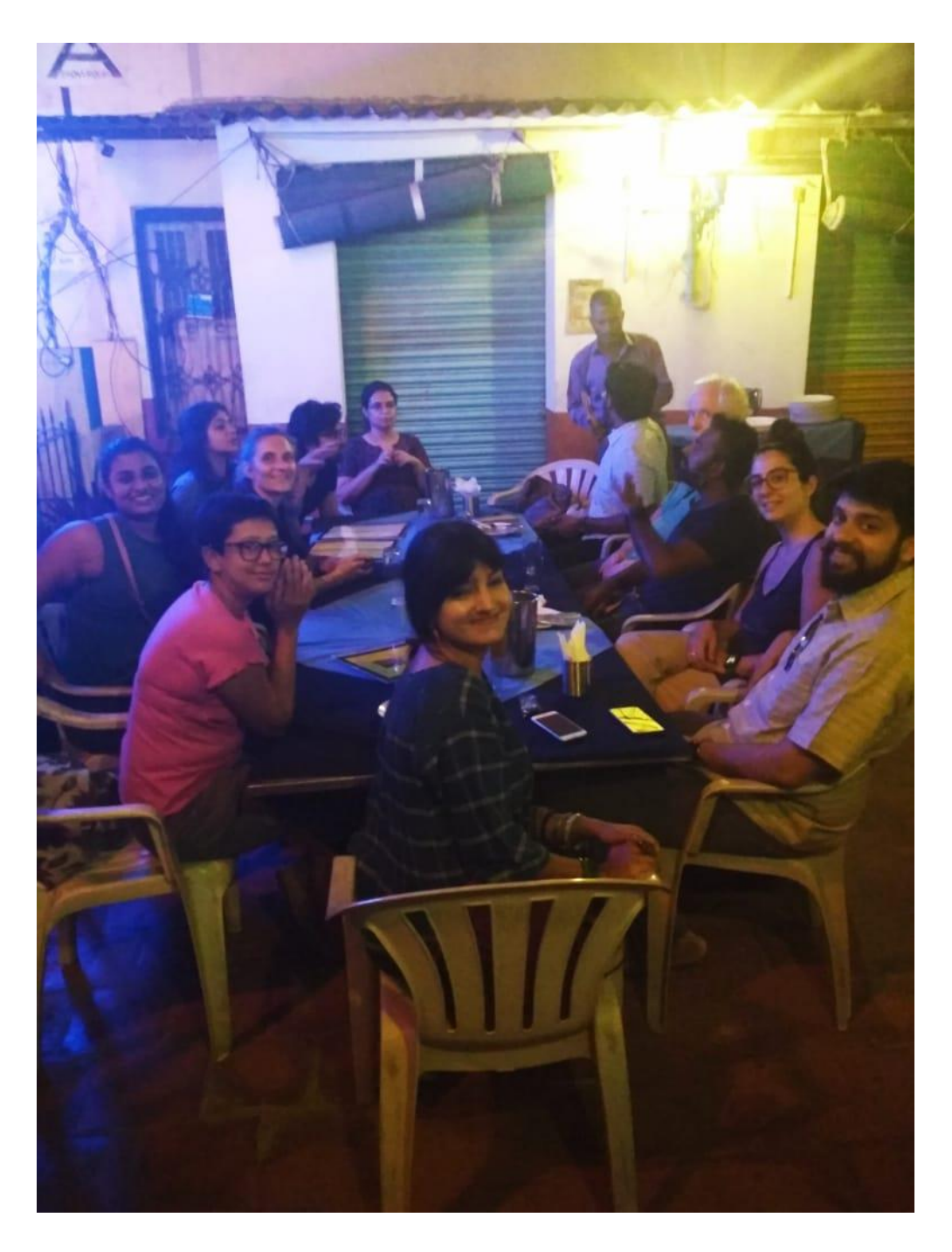
Participants dining at one of the restaurants in the culinary trail

An exclusive food walk was conducted from Feb 7- Feb 8. The food walk explored the local cuisine of Pondicherry ranging from local road side shops to restaurants to coffee shops to ice cream bars. The tour was designed and guided by Edwin of Eat Pondy. While the tour was free, participants paid for their food. Both the days, the trail was a hit and people kept asking for more such walks.