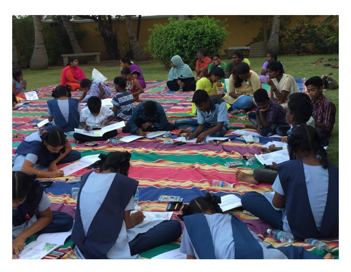
Participants enthusiastically colouring the book