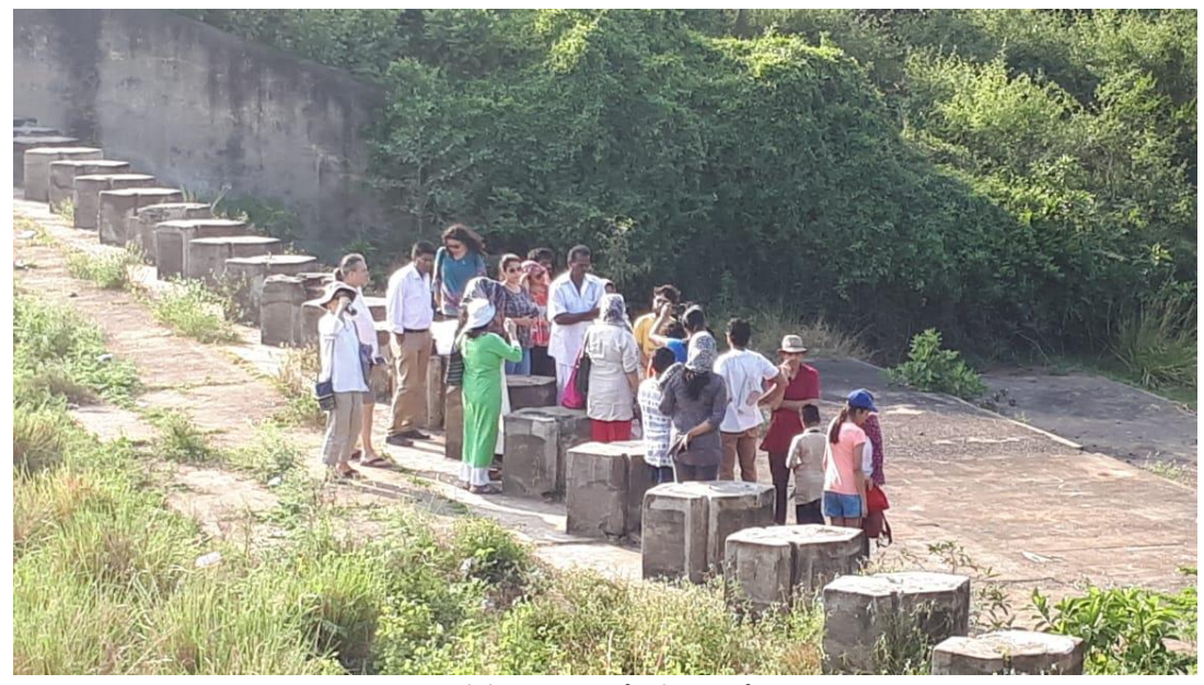
Participants exploring Bahour