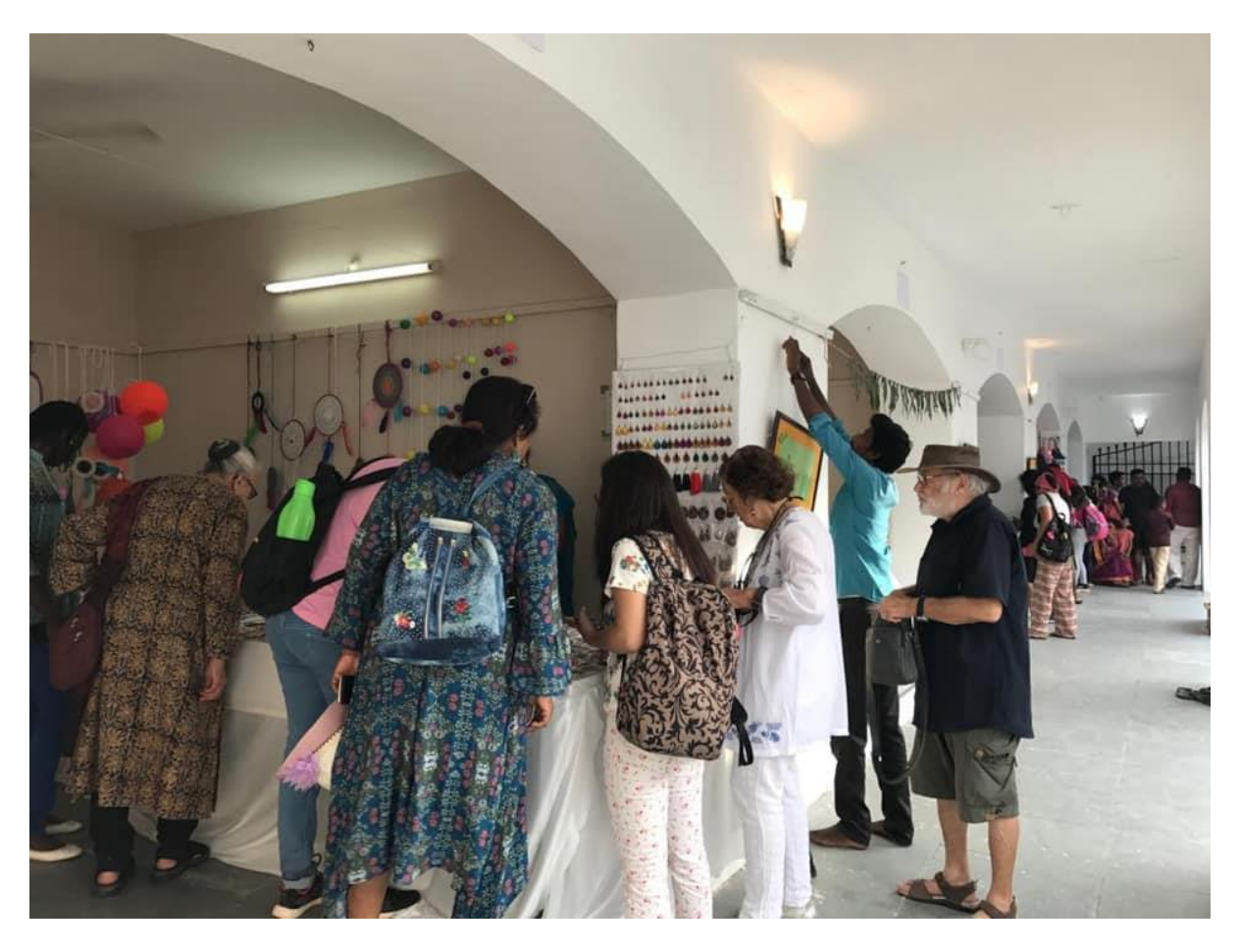
Locally made products at sale