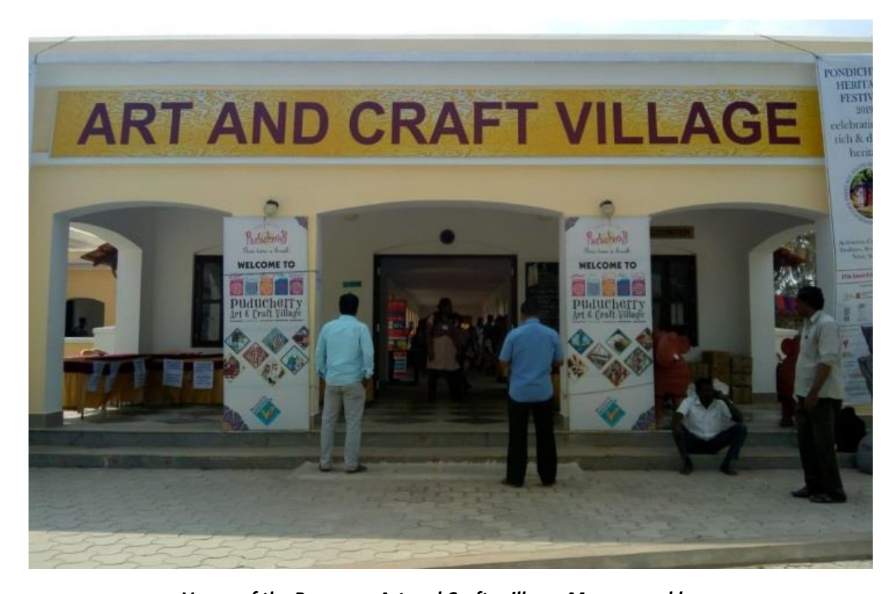
Venue of the Program: Art and Crafts village, Muruganpakkam

It was a huge logistical nightmare but thanks to volunteers from INTACH Pondicherry – their office staff, architects, Interns and college students from Mahatma Gandhi Medical College and PHF members were in large numbers to take care of registration, Event coordination Food and Security. The government agencies like Police outpost was created. Fire equipment's kept ready and a full-fledged ambulance was also ready at the site. The Tourism Department staff were very helpful, and the Director of Tourism attended the program and gave his speech to the students. Food was arranged for all 1100 students and to all accompanying teachers also. The program commenced at 8 00am and ended by 4 00 pm.