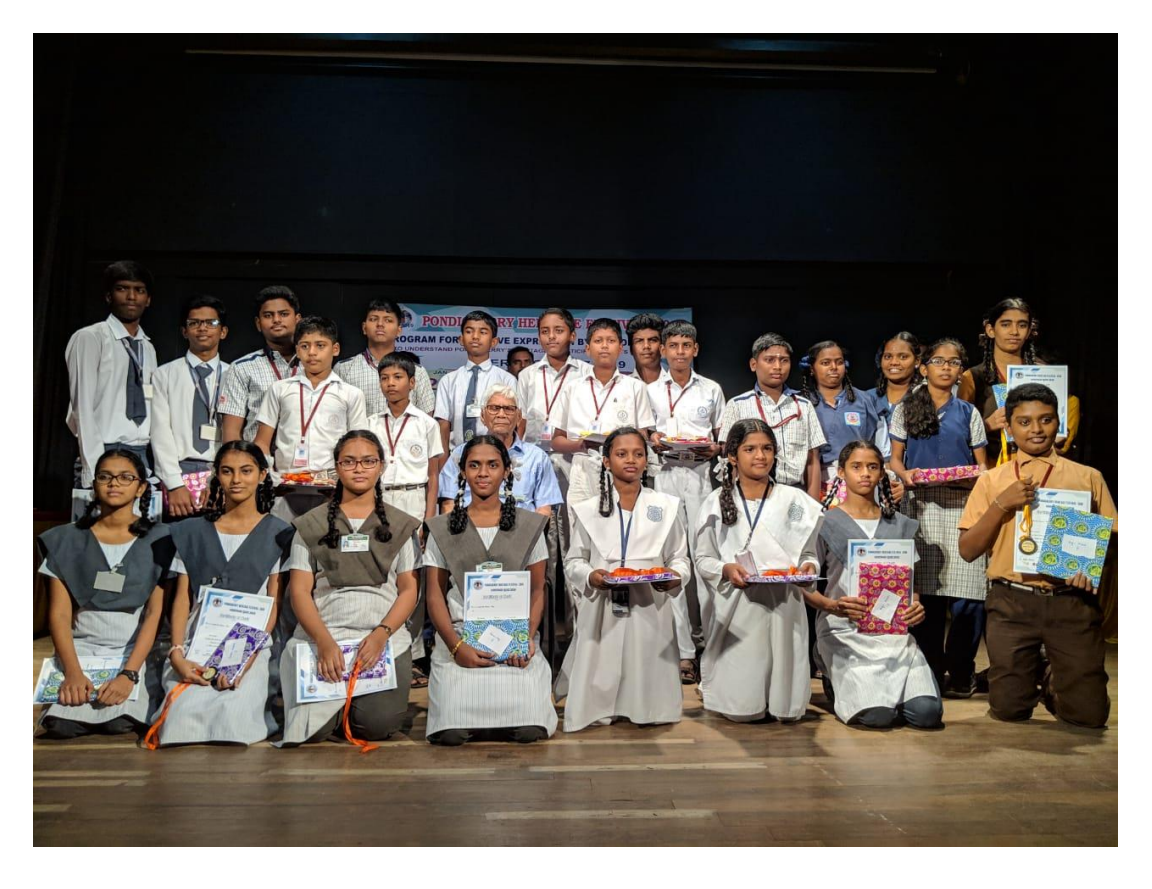
Prize winners with certificates and medals