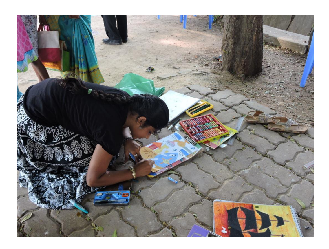
Painting and Kolam competition in progress